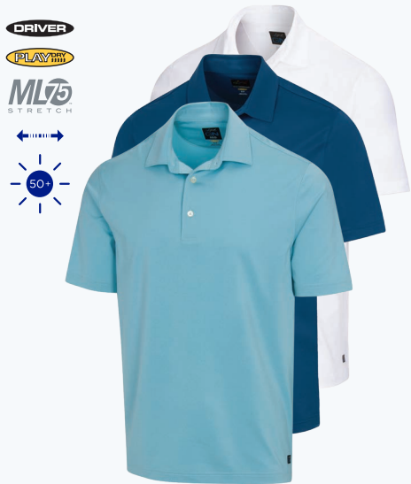
ML75 STRETCH SKY POLO 92% POLYESTER / 8% SPANDEX JERSEY

Tailored collar, Heathered solid, GN Collection logo on bottom left hem GNCW3495