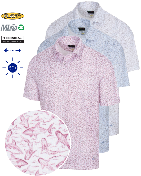
SHARK SKETCH POLO 100% RECYCLED POLYESTER INTERLOCK

Tailored collar, Sketched Shark print, GN logo on bottom left hem MSRP: $69.95 / GNCW3495