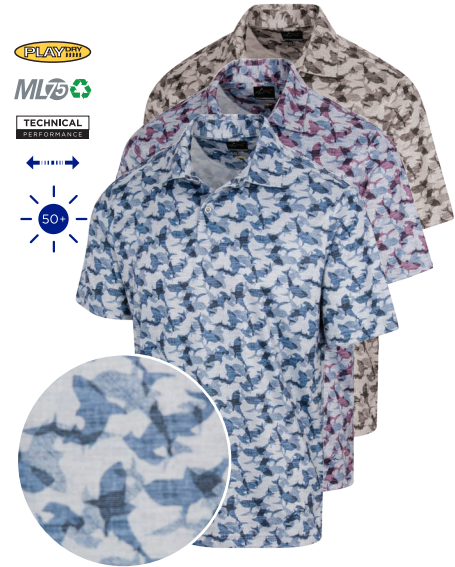
SHARK SHIVER POLO 100% RECYCLED POLYESTER INTERLOCK

Tailored collar, Shark Shiver print, GN logo on bottom left hem MSRP $69.95 / GNCW3495