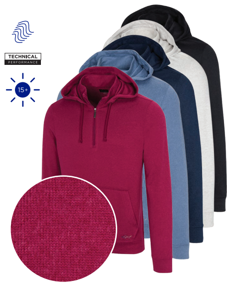
LAB 1/4-ZIP HOODIE 95% POLYESTER / 5% SPANDEX KNIT

Hoodie with a mock neck, Ultrasoft heathered handfeel, Kangaroo pocket, Blue-grey Shark logo on bottom left hem MSRP: $79.95 / GNCW3995