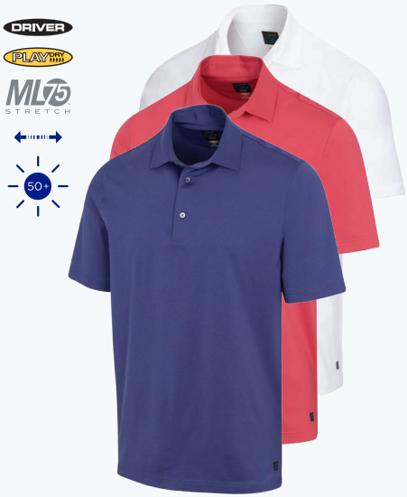
ML75 STRETCH SKY POLO 92% POLYESTER / 8% SPANDEX JERSEY

Tailored collar, Heathered solid, GN Collection logo on bottom left hem GNCW3495