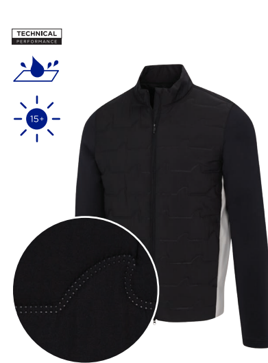
SHARK FIN FULL-ZIP JACKET 100% POLYESTER WOVEN

Mock neck, Water repellent, Lightly filled with ultrasonic embossed Shark Fin pattern, Double knit sleeves and contrast side inserts, Side pockets, GN Finlogo on center back neck MSRP $129.95 / GNCW6495