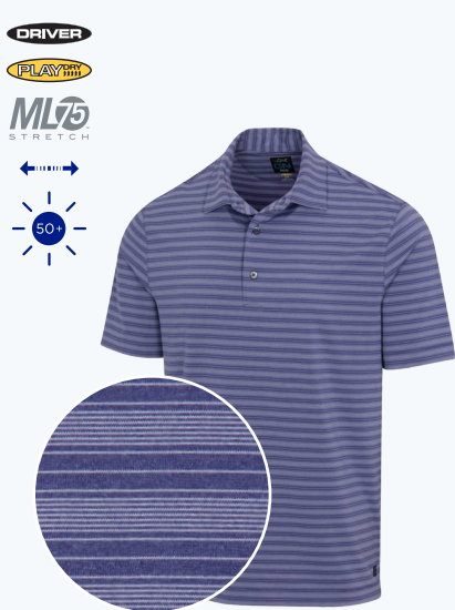
ML75 STRETCH HARBOR POLO 92% POLYESTER / 8% SPANDEX JERSEY

Tailored collar, Yarn-dye stripe, GN Collection logo on bottom left hem GNCW3795