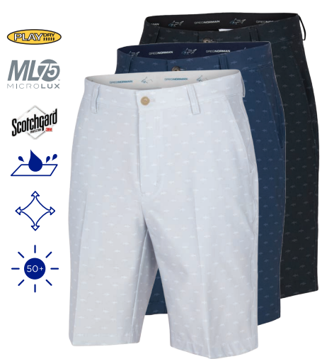
ML75 MICROLUX HYBRID SHARK PRINT SHORT 90% POLYESTER / 10% SPANDEX WOVEN

9-inch inseam, Flat front, Shark foulard print, Quick-dry water-resistant finish for performance in-and out- of water, Stretch shirt gripper waistband with logo, Mesh pocketing, Gunmetal Shark plate on back right pocket MSRP $69.95 / GNCW3495