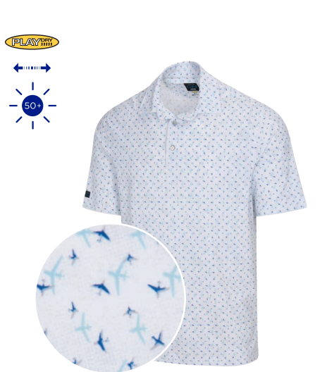
SKYWRITING POLO 92% POLYESTER / 8% SPANDEX JERSEY

Tailored collar, Airplane print, GN Collection logo on right sleeve MSRP $79.95 / GNCW3995