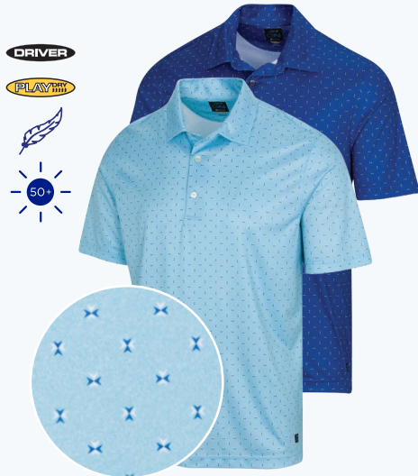
COMPASS POLO 100% POLYESTER FINE GAUGE INTERLOCK

Tailored collar, Compass foulard print, GN Collection logo on bottom left hem GNCW3995