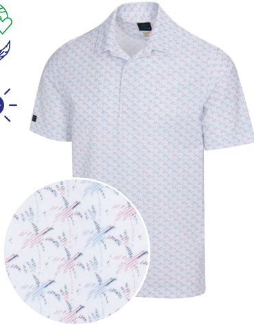
VINTAGE PALM POLO 91% POLYESTER / 9% SPANDEX PIQUE Tailored collar, Vintage Palm print, GN Collection logo on right sleeve MSRP: $79.95 / GNCW3995