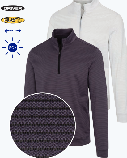
WEST BAY 1/4-ZIP 95% POLYESTER / 5% SPANDEX JACQUARD

Mock neck, Tonal textured ottoman, GN collection logo on back neck GNCW3995