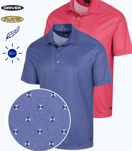
COMPASS POLO 100% POLYESTER FINE GAUGE INTERLOCK

Tailored collar, Compass foulard print, GN Collection logo on bottom left hem GNCW3995