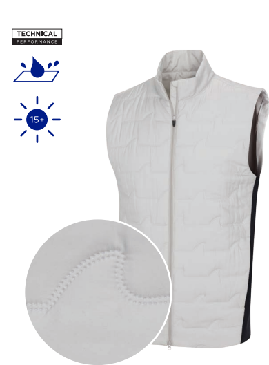
SHARK FIN FULL-ZIP VEST 100% POLYESTER WOVEN

Mock neck, Water repellent, Lightly filled with ultrasonic embossed Shark Fin pattern, Contrast knit side panels, Side pockets, GN fin logo on center back neck MSRP $109.95 / GNCW5495