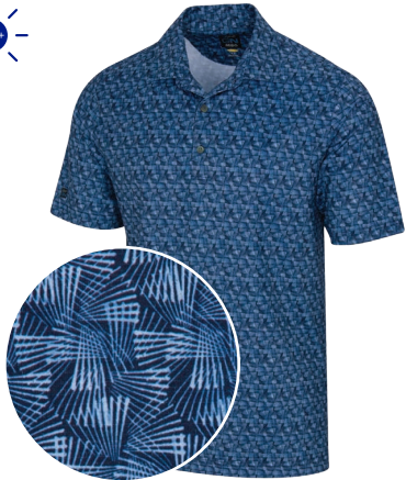
CAYMAN PALM ML75 POLO 89% RECYCLED POLYESTER / 11% SPANDEX MESH Tailored collar, Palm Leaf print, GN Collec- tion logo on right sleeve MSRP: $79.95 / GNCW3995