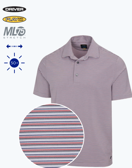
ML75 STRETCH LANDSCAPE POLO 92% POLYESTER / 8% SPANDEX JERSEY

Tailored collar, Multicolor yarn dye stripe, GN Collection logo on bottom left hem GNCW3995