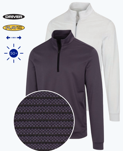
WEST BAY 1/4-ZIP 95% POLYESTER / 5% SPANDEX JACQUARD

Mock neck, Tonal textured ottoman, GN collection logo on back neck GNCW3995