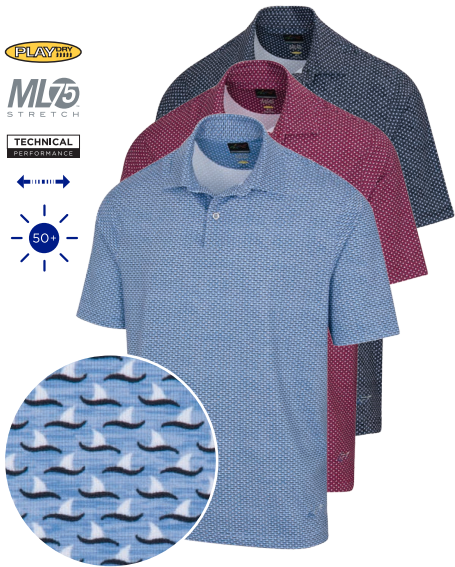
MICRO SHARK FIN POLO 92% POLYESTER / 8% SPANDEX JERSEY

Tailored collar, Fin Foulard print, GN logo on bottom left hem MSRP: $69.95 / GNCW3495