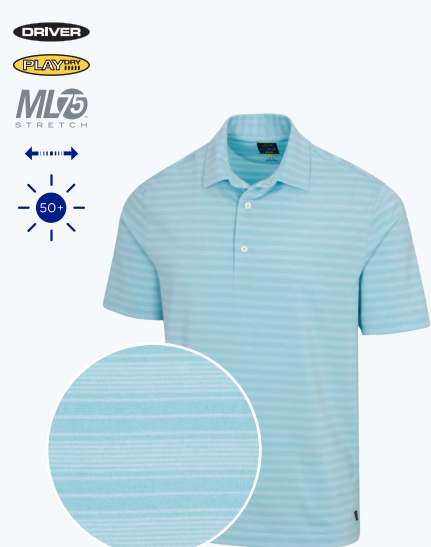
ML75 STRETCH HARBOR POLO 92% POLYESTER / 8% SPANDEX JERSEY

Tailored collar, Yarn-dye stripe, GN Collection logo on bottom left hem GNCW3795