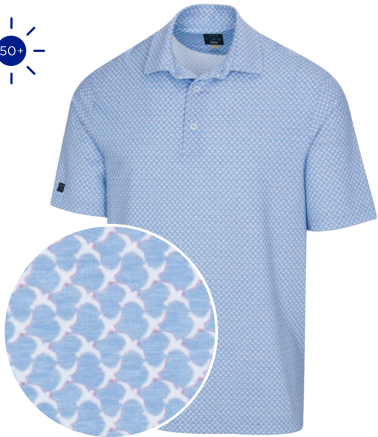
CATESBY POLO 92% POLYESTER / 8% SPANDEX JERSEY Tailored collar, Catesby Tropicbird foulard print, GN Collection logo on right sleeve MSRP: $79.95 / GNCW3995