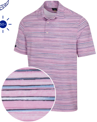
SEVEN MILE POLO 92% POLYESTER / 8% SPANDEX JERSEY Tailored collar, Watercolor Stripe print, GN Collection logo on right sleeve MSRP: $79.95 / GNCW3995