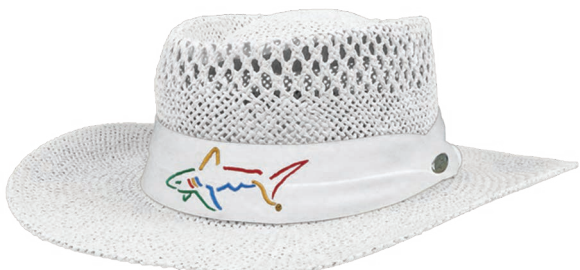
SIGNATURE STRAW HAT STRAW WITH TWILL BAND

Paper construction for airflow and breathability, All-around brim for sun shade, Four color Shark logo embroidered on band with debossed Shark emblem GNCW2499