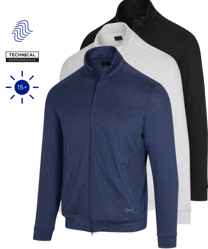
LAB FULL-ZIP JACKET 95% POLYESTER / 5% SPANDEX KNIT

Mock neck, Ultrasoft heathered knit, Side pockets with zippers, Blue-grey Shark logo on bottom left hem MSRP: $89.95 / GNCW4495