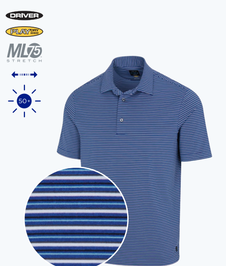
ML75 STRETCH LANDSCAPE POLO 92% POLYESTER / 8% SPANDEX JERSEY

Tailored collar, Multicolor yarn-dye stripe, GN Collection logo on bottom left hem GNCW3995