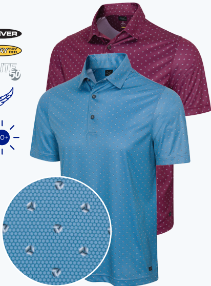
X-LITE TREASURE POLO 100% POLYESTER INTERLOCK

Tailored collar, Braided Knot foulard print, Shark Collection logo on bottom left hem MSRP: $79.95 / GNCW3995