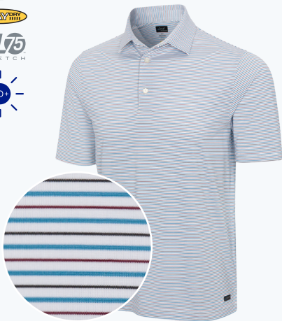
ML75 STRETCH SEASON STRIPE POLO 92% POLYESTER / 8% SPANDEX JERSEY

Tailored collar, Multicolor yarn-dye stripe, Shark Collection logo on bottom left hem MSRP: $79.95 / GNCW3995