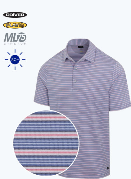
ML75 STRETCH VISTA POLO 92% POLYESTER / 8% SPANDEX JERSEY

Tailored collar, Multicolor yarn-dye stripe, Shark Collection logo on bottom left hem GNCW3795