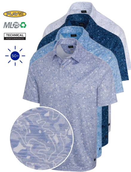
MARBLE SHARK ML75 POLO 100% RECYCLED POLYESTER INTERLOCK

Tailored collar, Marble Shark print, Shark Collection logo on bottom left hem MSRP: $69.95 / GNCW3495