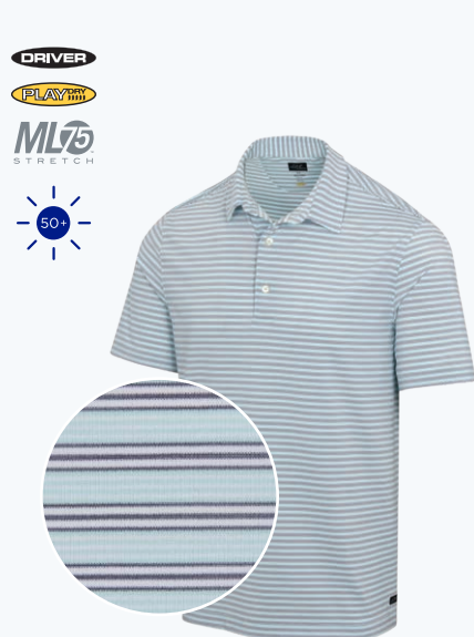
ML75 STRETCH VISTA POLO 92% POLYESTER / 8% SPANDEX JERSEY

Tailored collar, Multicolor yarn-dye stripe, Shark Collection logo on bottom left hem GNCW3795