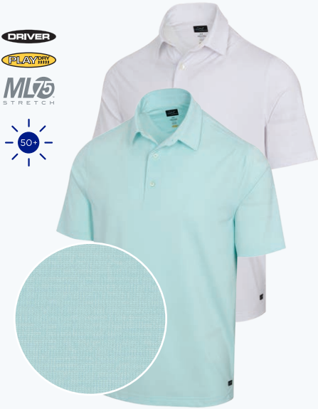
ML75 STRETCH HORIZON POLO 92% POLYESTER / 8% SPANDEX JERSEY

Tailored collar, Heathered micro two-tone stripe, Shark Collection logo on bottom left hem GNCW3495