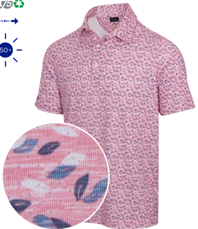
FOLIAGE ML75 STRETCH POLO 89% RECYCLED POLYESTER / 11% SPANDEX MESH

Tailored collar, Tossed leaf print, Shark Collection logo on right sleeve MSRP: $79.95 / GNCW3995