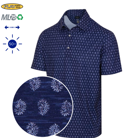
STELLAR ML75 STRETCH POLO 89% RECYCLED POLYESTER / 11% SPANDEX MESH Tailored collar, Batik Paisley print, Shark Collection logo on right sleeve MSRP: $79.95 / GNCW3995