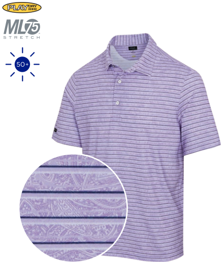
DUSK ML75 STRETCH POLO 92% POLYESTER / 8% SPANDEX JERSEY Tailored collar, Stripe and paisley print, Shark Collection logo on right sleeve MSRP: $79.95 / GNCW3995