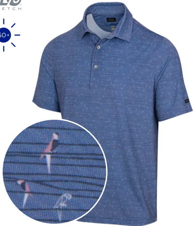
PARROT ML75 STRETCH POLO 92% POLYESTER / 8% SPANDEX JERSEY

Tailored collar, Parrot print, Shark Collection logo on right sleeve MSRP: $79.95 / GNCW3995