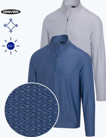
BACKSWING 1/4 ZIP 86% POLYESTER / 14% SPANDEX JERSEY

Mockneck, Tonal micro geo print, Shark Collection logo on back neck GNCW3995