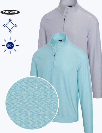
BACKSWING 1/4 ZIP 86% POLYESTER / 14% SPANDEX JERSEY

Mockneck, Tonal micro geo print, Shark Collection logo on back neck GNCW3995