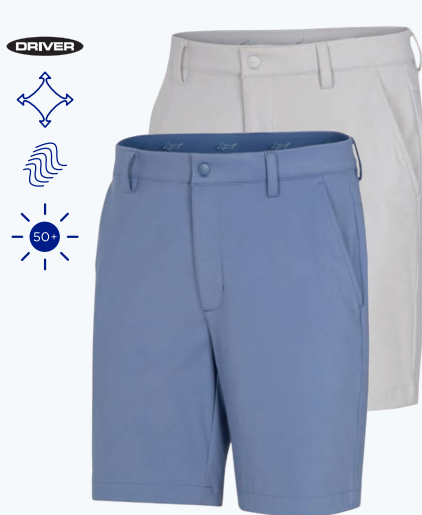
STANCE KNIT SHORT 79% NYLON / 21% SPANDEX KNIT

8 1/2-inch inseam, Flat front, Scorecard side seam pocket with invisible zipper, Snap closure, Stretch shirt gripper waistband with Shark logo, Stretch mesh pocketing, Shark Collection logo above back right pocket GNCW3795