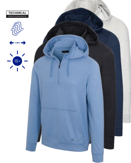
LAB 1/4-ZIP HOODIE 95% POLYESTER / 5% SPANDEX KNIT

Mock neck with hoodie, Ultrasoft heathered handfeel, Kangaroo front pocket, Blue-grey Shark logo on bottom left hem MSRP: $79.95 / GNCW3995