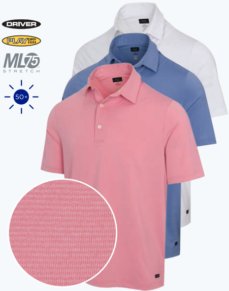
ML75 STRETCH HORIZON POLO 92% POLYESTER / 8% SPANDEX JERSEY

Tailored collar, Heathered micro two-tone stripe, Shark Collection logo on bottom left hem GNCW3495