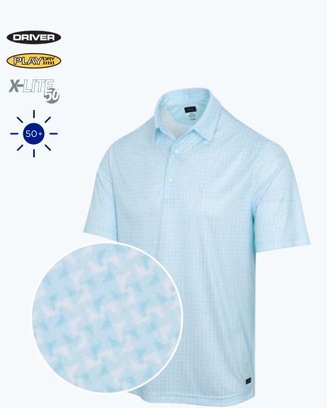
X-LITE WINDMILL POLO 100% FINE GAUGE POLYESTER INTERLOCK

Tailored collar, Tonal Windmill geo print, Shark Collection logo on bottom left hem GNCW3995