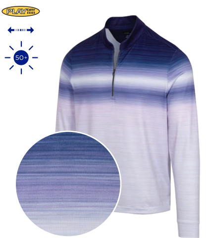
SUNSET OMBRÉ 1/4 ZIP 94% POLYESTER / 6% SPANDEX JERSEY Player's collar, Sunset Ombre print, Shark Collection logo on back neck MSRP: $89.95 / GNCW4495