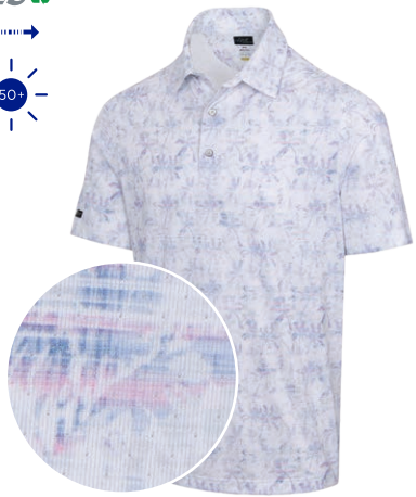
CROSSHATCH PALM ML75 STRETCH POLO 89% RECYCLED POLYESTER / 11% SPANDEX MESH

Tailored collar, Sunwashed Palm print, Shark Collection logo on right sleeve MSRP: $79.95 / GNCW3995