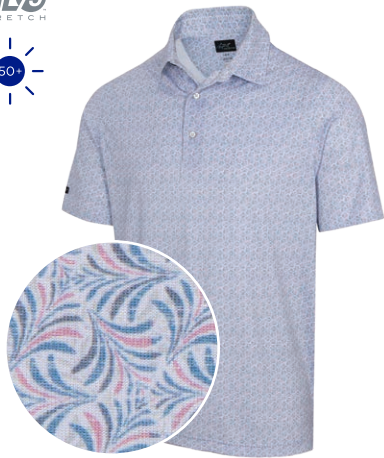
ISLAND FLORA ML75 STRETCH POLO 92% POLYESTER / 8% SPANDEX JERSEY

Tailored collar, Olive stem print, Shark Collection logo on right sleeve MSRP: $79.95 / GNCW3995