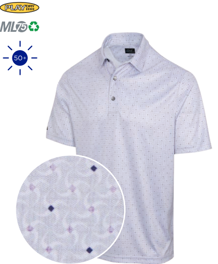
STARBEAM ML75 POLO 100% RECYCLED POLYESTER INTERLOCK Tailored collar, Starbeam print, Shark Collection logo on right sleeve MSRP: $79.95 / GNCW3995