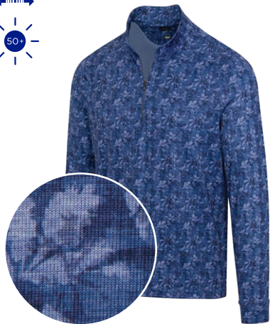
PALM STAMP ¼ ZIP 94% POLYESTER / 6% SPANDEX JERSEY

Player's collar, Tonal Palm print, Shark Collection logo on back neck MSRP: $89.95 / GNCW4495