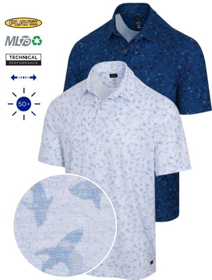
SEA SHARK ML75 STRETCH POLO 88% RECYCLED POLYESTER / 12% SPANDEX MESH

Tailored collar, Open Sea Shark print, Shark Collection logo on bottom left hem MSRP: $69.95 / GNCW3495