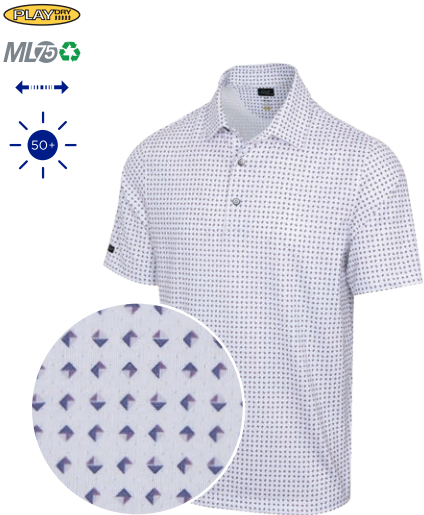
ECLIPSE ML75 STRETCH POLO 89% RECYCLED POLYESTER / 11% SPANDEX MESH Tailored collar, Eclipse print, Shark Collection logo on right sleeve MSRP: $79.95 / GNCW3995