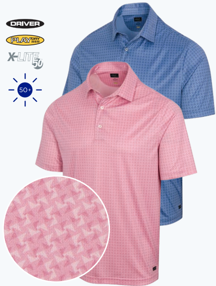
X-LITE WINDMILL POLO 100% FINE GAUGE POLYESTER INTERLOCK

Tailored collar, Tonal Windmill geo print, Shark Collection logo on bottom left hem GNCW3995