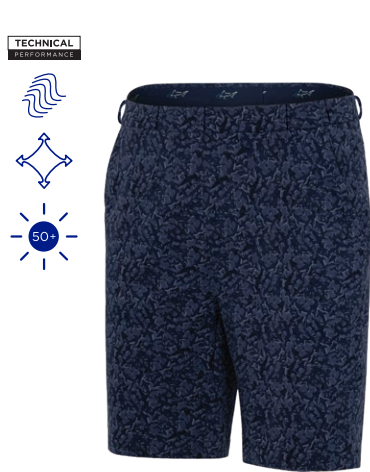
SHIVER SHARK PULL-ON SHORT 79% NYLON / 21% SPANDEX KNIT

8 1/2-inch inseam, Flat front, Shiver Shark print, Ultrasoft handfeel, Stretch shirt gripper waist- band with Shark logo, Stretch mesh pocketing, Shark Collection logo above back right pocket MSRP: $75.95 / GNCW3795