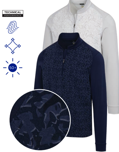
SHIVER SHARK PRINT WARP-KNIT 1/4 ZIP 79% NYLON / 21% SPANDEX KNIT

Player's collar, Shiver Shark print front body, Ultrasoft handfeel, Shark Collection logo on back neck MSRP: $89.95 / GNCW4495