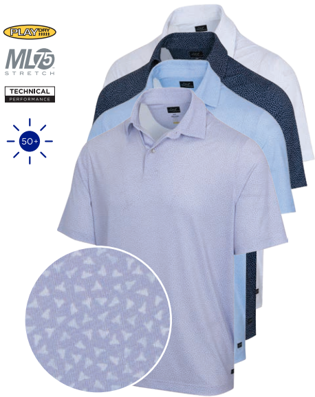
FOSSIL SHARK ML75 STRETCH POLO 92% POLYESTER / 8% SPANDEX JERSEY

Tailored collar, Fossil Shark tooth print, Shark Collection logo on bottom left hem MSRP: $69.95 / GNCW3495