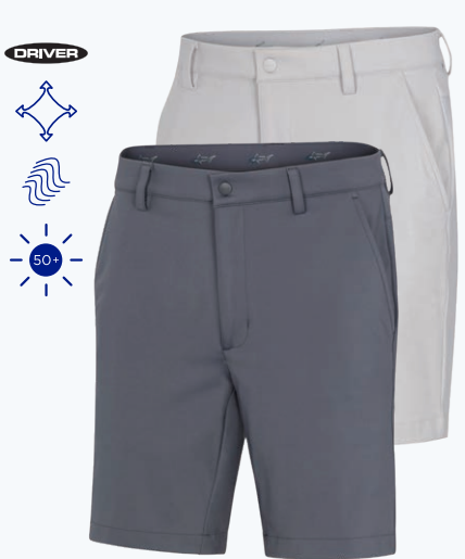
STANCE KNIT SHORT 79% NYLON / 21% SPANDEX KNIT

8 1/2-inch inseam, Flat front, Scorecard side seam pocket with invisible zipper, Snap closure, Stretch shirt gripper waistband with Shark logo, Stretch mesh pocketing, Shark Collection logo above back right pocket GNCW3795